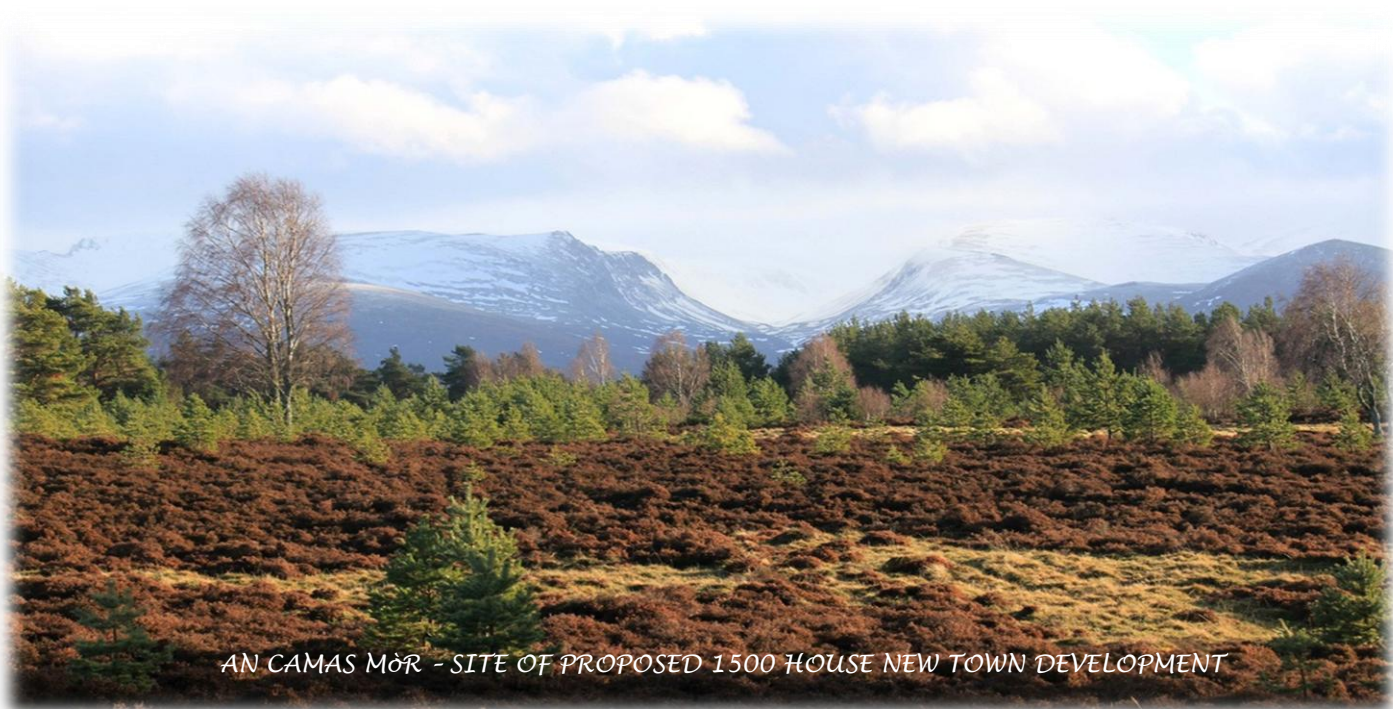
AN CAMAS MòR - SITE OF PROPOSED 1500 HOUSE NEW TOWN DEVELOPMENT