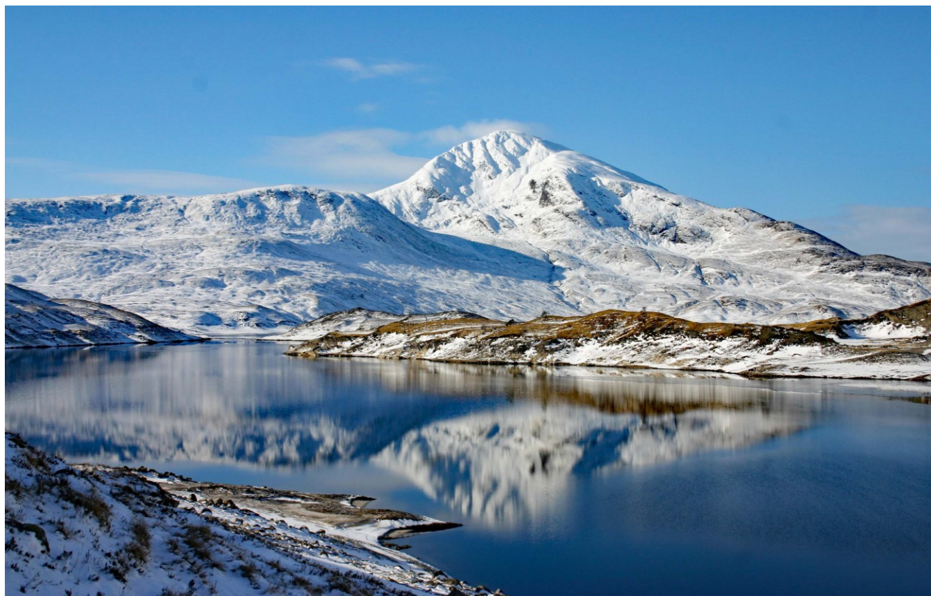
The classic view of Gairich from Loch Cuaich – see article on page 20 (John Marjoram)